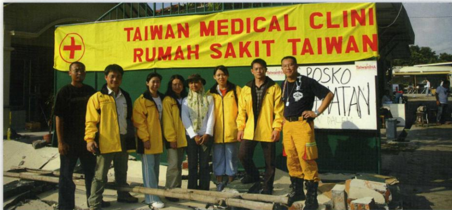
TaiwanIHA established medical clinic in Java, Indonesia, after the earthquake.

With the goal of increasing coordination, Taiwanese experts have concluded that in line with the World Health Organization's spirit of aiding nations in times of need, Taiwan should create a single institution to increase efficiency and efficacy in the coordination and delivery of health-related assistance programs, involving both the public and private sectors. Progress towards this objective was realized on February 6, 2006 with the establishment of the Taiwan International Health Action ( TaiwanIHA ) by the Department of Health (DOH) and the Ministry of Foreign Affairs (MOFA), and the approbation of the Executive Yuan. Co-funded by the DOH and the MOFA, the TaiwanIHA is an ad hoc task force whose remit is to integrate the resources and capabilities of the public (government) and the private sectors into a coordinated platform for international medical and health cooperation.