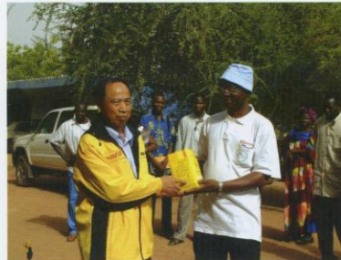
TaiwanIHA team members provided disinfectants to workers in Burkina Faso.