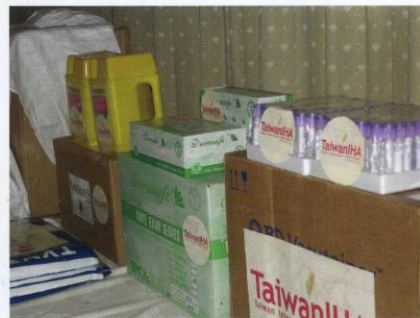
Medical relief materials are ready to dispatch to Indonesia for emergency assistance.

The TaiwanIHA has five main missions. First, it coordinates the efforts at home and abroad in the areas of international medical and health cooperation in addition to humanitarian emergencies. Secondly, it plans the international health contributions of Taiwan, which has to be comprehensive. Indeed, simultaneously to several medical missions, TaiwanIHA wants to adopt an approach emphasizing on public health education and training in order to progressively help the needy people to be more autonomous to deal with infectious diseases and health crisis. Third, it also allocates qualified human expertise, medicine and medical equipment for Taiwan's international health activities. One of the tools that the TaiwanIHA uses make its allocation of equipment abroad more efficient is the Global Medical Instruments Support and Service Program (GMISS). This program, established in May 2005,