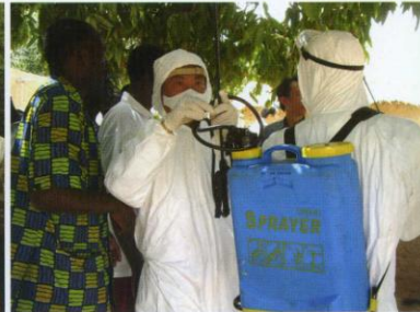
TaiwanIHA experts showed the workers of Burkina Faso hygiene technique in the village.