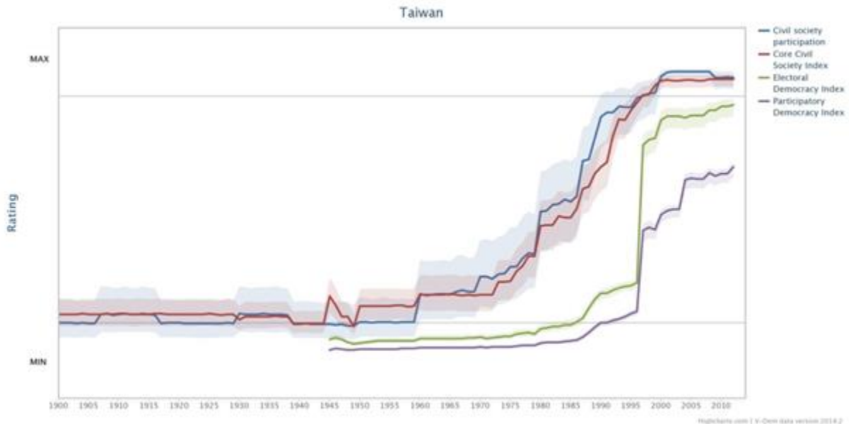
Figure 4. Civil society and democratization development in Taiwan (Source: Graph generated from Varieties of Democracy (V-Dem) online analysis in https://v-dem.net/DemoComp/en/ , accessed on Feb. 2, 2015).

development, represented by electoral and participatory democracy in the graph below, with sharp upward growth in 1996 marked by the first direct presidential election. The evolution of state-society relations in Taiwan also tells the story of a democratizing Taiwan.